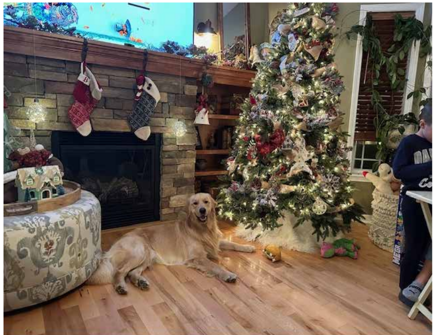
Bodhi at Christmas