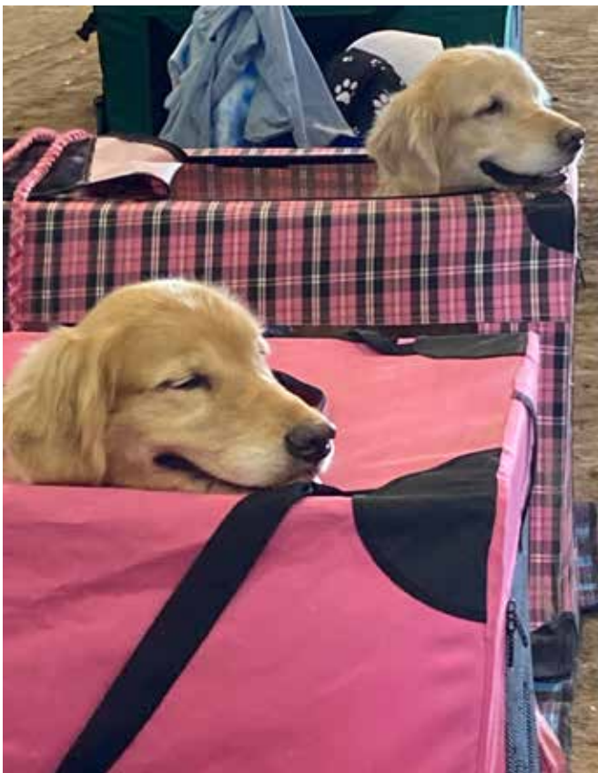
No idea who they were, but Rue was instantly charmed by these two upright-napping ladies in their immaculate pink crates.