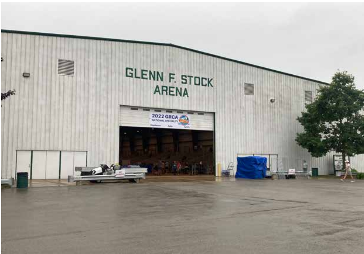
A spacious livestock arena at the Monroe County Fairgrounds was the venue for agility, obedience and rally obedience competition – over a span of four days.

And most absolutely we all had a blast with our dogs, cheering our own and those of our friends too. There were many successes and some near misses. But regardless, with or without ribbons, the "Great Takeaway" from this national specialty was GREAT MEMORIES.