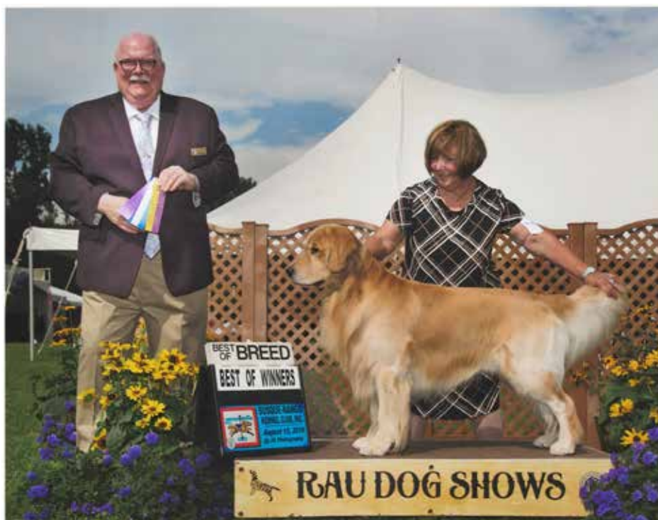
Painting-Storybook Serenity Duffy R, CH-UKC, CCA, CGCA, TKP, RI, DM, RATO, FDC

Our goal is to “finish” Duffy, which means a championship. To attain that goal he must earn 15 points and 2 majors and is well on his way. Points are awarded only for Winners Dog/Bitch and Best of Winners and they are dependent upon how many dogs are shown that day. Further the number of dogs needed for each point category varies by region in the US and can be found in most show programs as well as through the AKC website. A major is a show that awards 3-5 points. {In Canada, a dog needs 10 points and 2 majors and their point system is national}. The dream is now within reach and very exciting! !