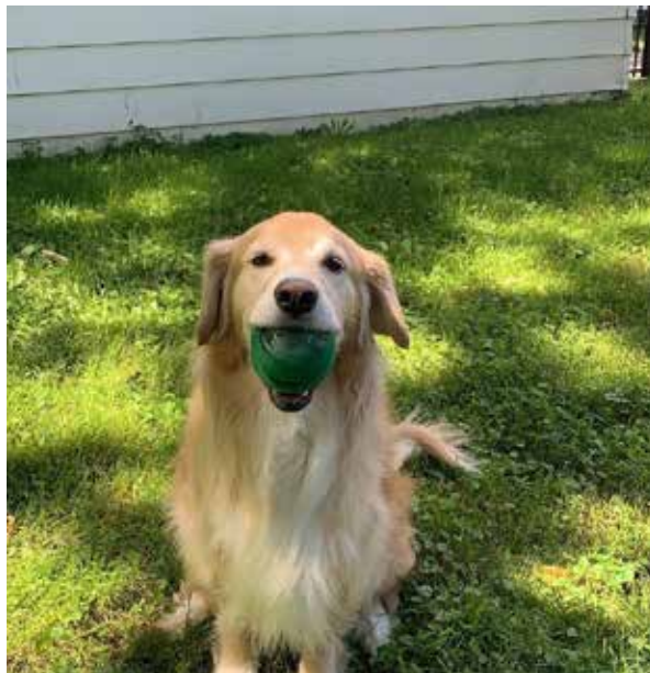
Koda in his new backyard

Where to even begin! Koda and I had a mostly uneventful summer filled with swimming in the pool and fetching balls. Our biggest adventure began at the end of August when we finally closed on our first house. Apartment living was not our thing so it was so exciting when we were finally able to find a home to call our own. Since then, Koda has become a great neighborhood watch dog. He makes sure to bark at anybody who walks by our house so that they know he means business! One of his favorite things to do in